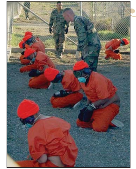
Camp X-Ray, Guantanamo Bay.