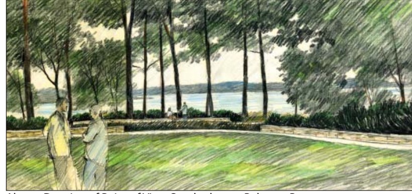
Above: Drawing of Point of View Overlook onto Belmont Bay.

"Ed and Helen Lynch could see the potential for Point of