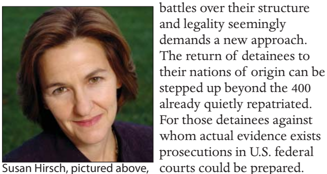
is an ICAR Professor.

created by Congress's refusal to appropriate sufficient funds for Military Commission proceedings and court